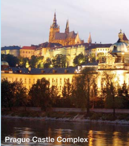
Prague Castle Complex